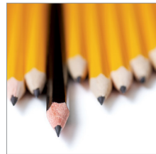
WORKSHOPS & SPEAKING ENGAGEMENTS